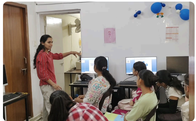
Where donated devices end up: at our centre and partner colleges.